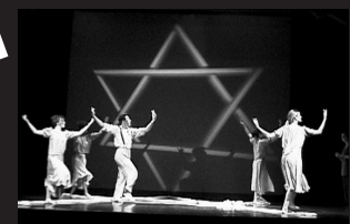
Dancers in the revised version of "Yellow Star" at the Ivar.