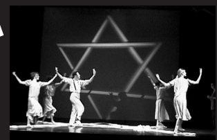
Dancers in the revised version of "Yellow Star" at the Ivar.