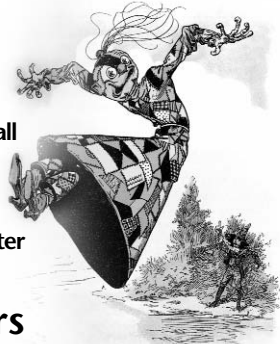
Patchwork Girl illustrations by John R. Neill