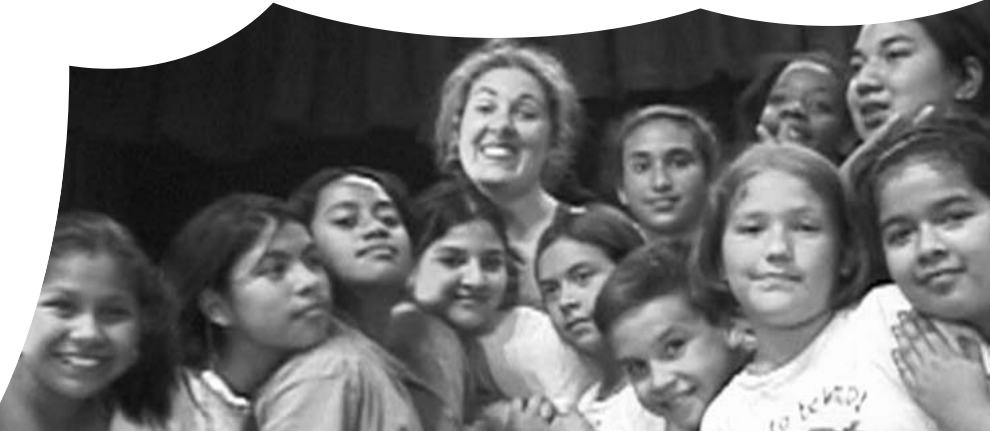
photos: oval above: Our dancers with a kindergarten class at Broad Avenue Elementary after performances. This photo: after-school program at Felton